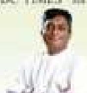
Department of Public Health Dentistry, 2016-2021 TREATMENT RENDERED IN CAMP