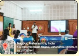
Interns Club - An interns club scientific presentation programme was held on 18th October 2022 showing various cases that the interns had managed in their internship.