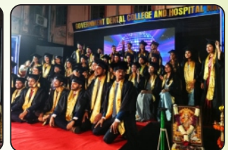
Convocation - Batch 2k17 (Organised by batch 2k18) at Government Dental college & Hospital Nagpur 3/12/2022