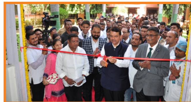
Inauguration of Department of comprehensive Dentistry by the hands of Honorable Deputy CM of Maharashtra State Sri Devendraji Fadanvis. on date 23/11/2022