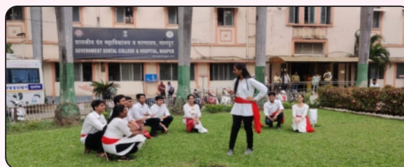
World No Tobacco Day celebrated on 31 may. Nukkad natak was performed at ST bus stand ganeshpeth by 2019 batch