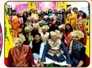
GFC (MANOMAY-2022) organized by batch 2020 at Government Dental Boys Hostel 31st Aug-5th Sep.