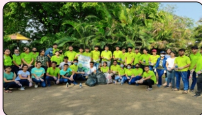
Nature club site visit on the occasion of World environment day