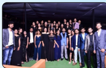
Swarnim 2022 -Annual Gathering : organized by batch 2017 including different events 6th October to 11th october