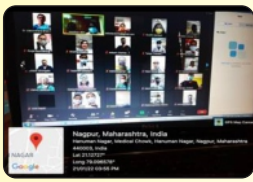
Interns orientation: An online interns orientation programme was conducted at the beginning of the year to give an insight of the clinical functioning of each department.