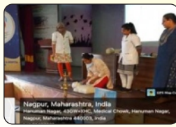
Basic life support(BLS) workshop, demonstration and lecture of cardiopulmonary resuscitation.