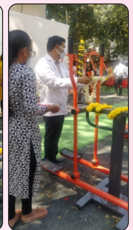
Tree plantation and green gym inauguration at Government Dental Boys Hostel