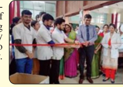
Joy of giving- Celebrating 25 years of independence, a joy of giving donation camp was organised by the interns of the batch 2017, to help the poor and needy.