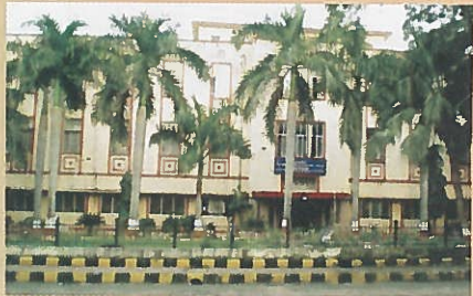
GOVERNMENT DENTAL COLLEG & HOSPITAL, NAGPUR